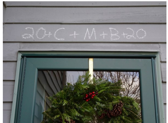
Photo caption: The combination of numbers, letters and symbols involved in chalking the door evokes the year, the cross and the traditional names of the kings: Caspar, Melchior and Balthazar. The letters are also an abbreviation for “Christus Mansionem Benedicat,” which means “May Christ bless this dwelling.”

Lesbia Scott (1898–1986) published her famous hymn “I Sing a Song of the Saints of God” (Hymn 293 in The Episcopal Hymnal 1982; and Hymn 364 in The Presbyterian Hymnal 1989) in 1929. At the end of verse three, this hymnist beholden us to our Christian responsibility of caring for our brothers and sisters in Christ, “You can meet them in school, or in lanes, or at sea, in church, or in trains, or in shops, or at tea; for the saints of God are just folk like me, and I mean to be one too.” As we pass the homes of our neighbors, may we pray, “May Christ Bless this dwelling.”