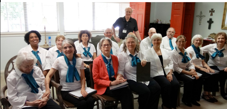
Picture above: Together in Voice Choir rehearsing in the FPC Alvin, Choir Room.

Together in Voice is a choir especially designed for people suffering early stage memory lost and their caregivers. On Wednesday, June 12, this ensemble sang for the Gathering Place in the Fellowship Hall. They welcome new singers to join them in the Fall. To learn more about the group please visit their facebook page at www.facebook.com/togetherinvoice . Together in Song rehearses every Tuesdays from 10:00 a.m. to 12:00 noon at Chapelwood United Methodist Church, 11140 Greenbay St., Houston, TX 77024.