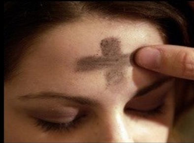
Remember that you are dust, and to dust you shall return. ✧ Ecclesiastes 3:20 ✧

worship practices God cares about, but their relationships with others. And since God cares about those in the margin, we are to walk with God in a way that brings justice, humility and love for all others.”