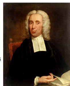
Reverend Isaac Watts