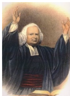
Reverend George Whitfield

The second was the Great Awakening which began in 1738 and introduced this English hymnody into American churches. When the stirring British pulpiteer George Whitefield made his first preaching tour of the American colonies he championed Watts's hymns, which were more suited to his fervid style of preaching and the wildly emotional responses of the hearers, than were the metrical psalms. In the five years after Whitefield's arrival, at least six reprints of Watts's hymnic works appeared from American presses. Calvin's greatest fears were coming true!