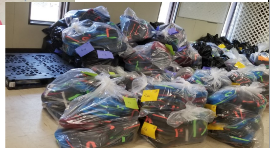
So many bags full of backpacks.