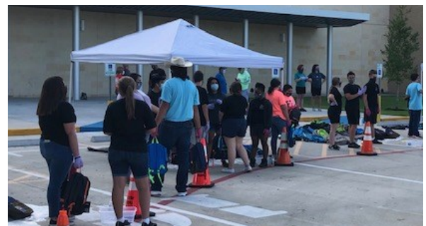
Drive-through distribution was a complete success!!