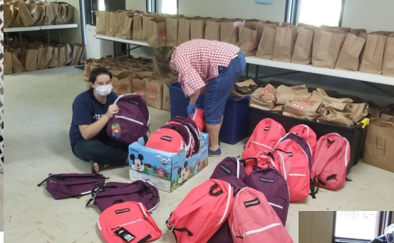
Packing the backpacks!