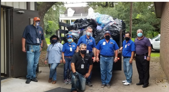
Thanks to AISD maintenance dept for picking up the filled backpacks.