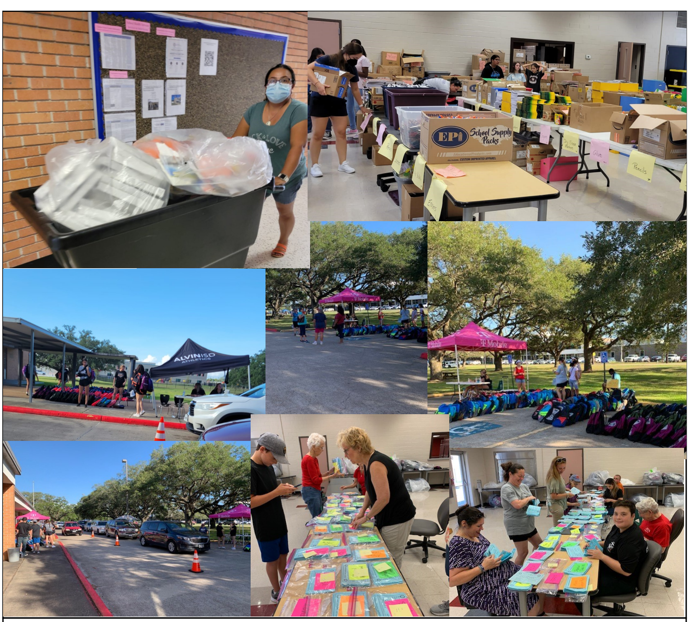
Cont. from cover

There are places where she could never be who she is. Only in a country that accepts all people and gives people a chance to be who they can be, would she ever be able to do what she believes is her calling. The folks at UTMB sing her praises. They love her and so do I .