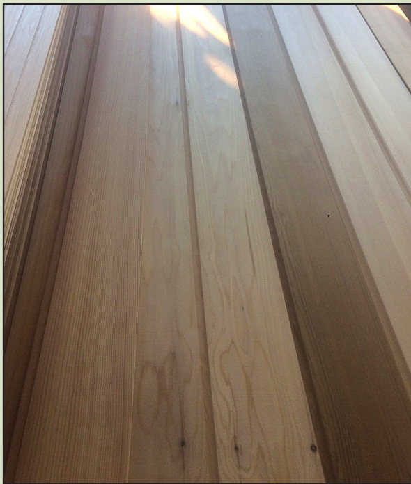
Clear C & Better All Patterns Kiln Dried