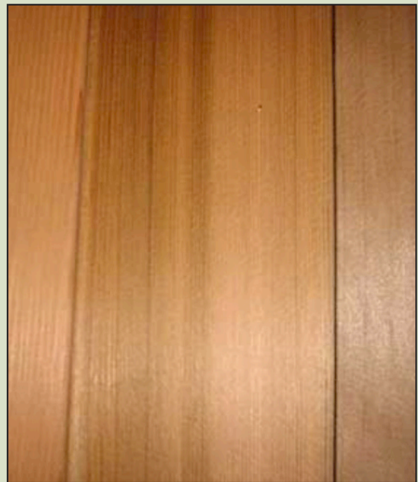
Clear A Vertical Grain All Patterns Kiln Dried