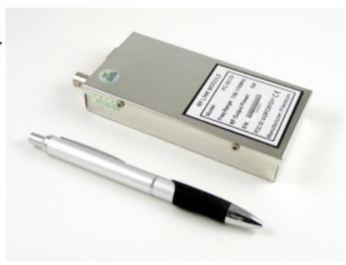
Argent Data Tracker