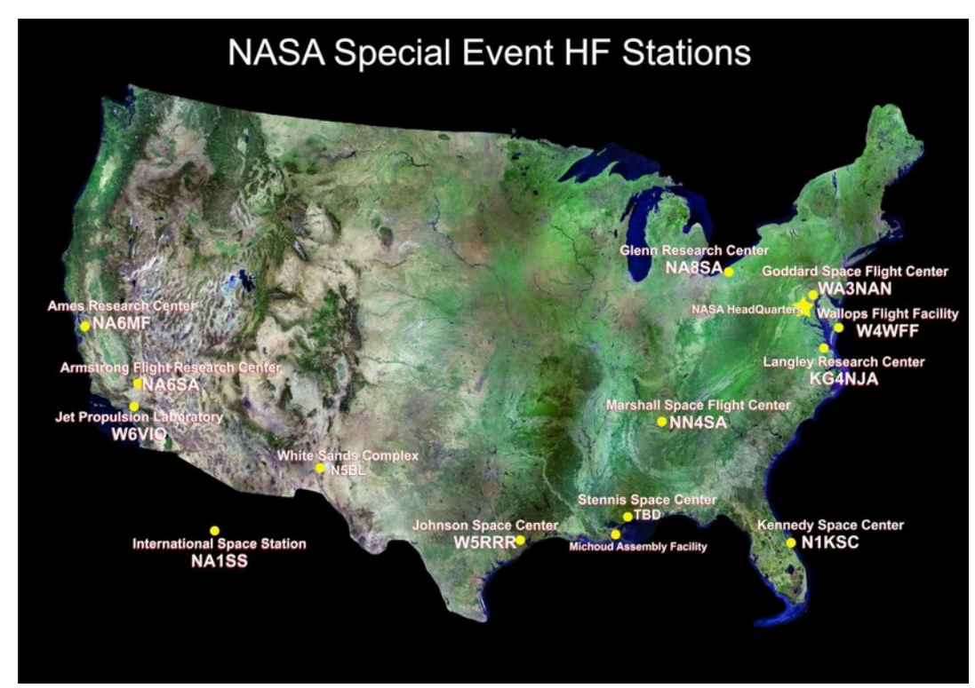
Celebrate Its Big Anniversaries!

The agency was founded in 1958 (60 years old). 1968 was Apollo 8, the first manned mission to the moon (50 years ago). The first elements of the International Space Station were launched in 1998 (20 years ago ... really?)