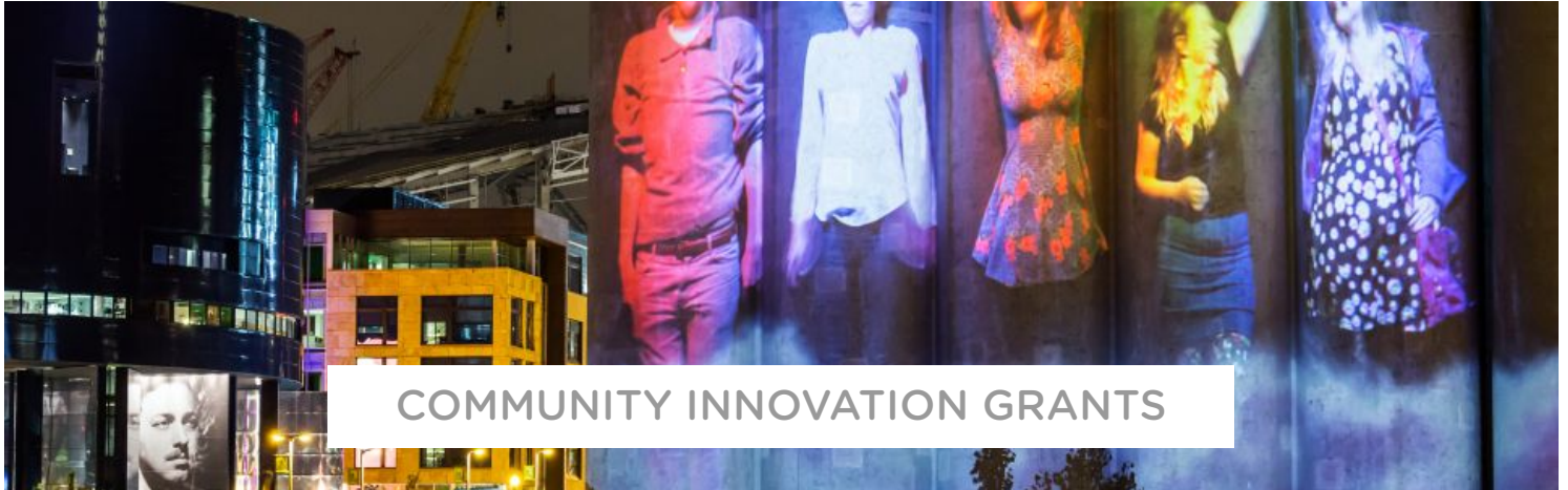
Northern Lights.mn's event Northern Spark 2015.

Community Innovation Grants support communities to use problem-solving processes that lead to more effective, equitable and sustainable solutions. Think of it as civic R&D, allowing communities to develop and test new solutions to community challenges.