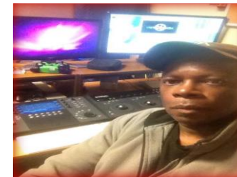
Videography Gregory Tucker