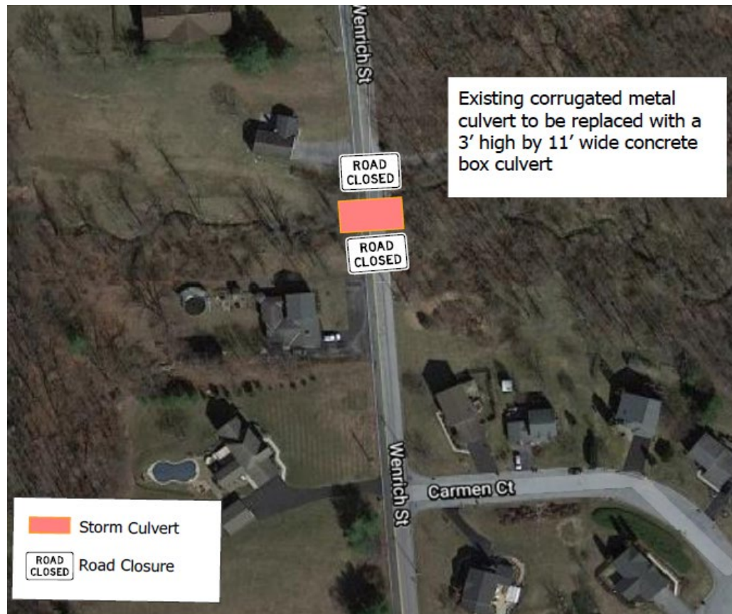
Figure 1: Wenrich Street Culvert Replacement