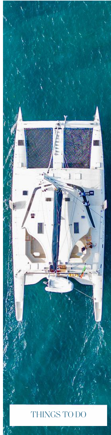
THINGS TO DO