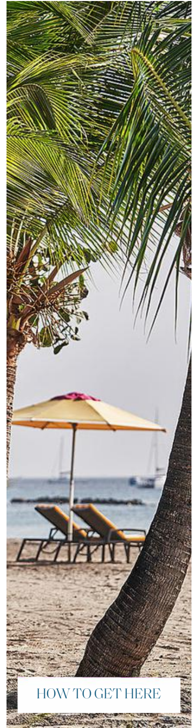
HOW TO GET HERE