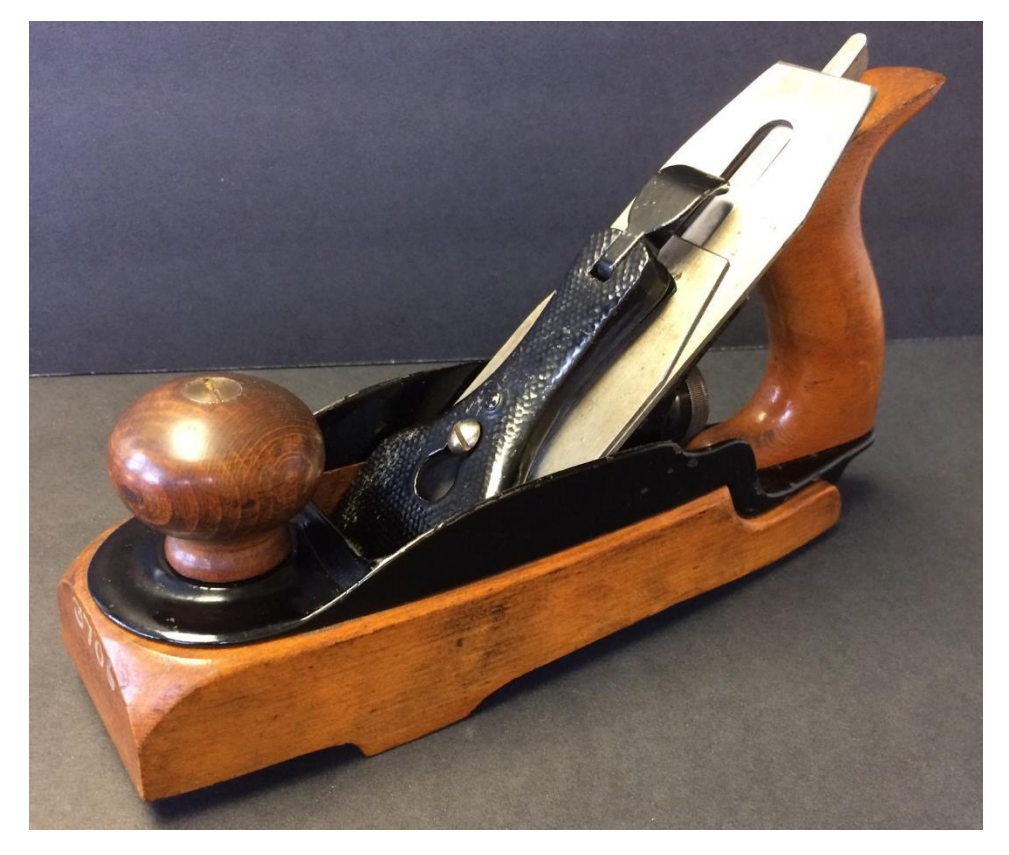
Figure 1 Stanley prototype transitional furring plane

With that introduction, we now turn to the subject of this piece, a transitional furring plane prototype (Figure 1). This is one of my favorite prototypes because of its simplicity and its self-documenting provenance. As with many Model Shop planes, this one shows no signs of use.