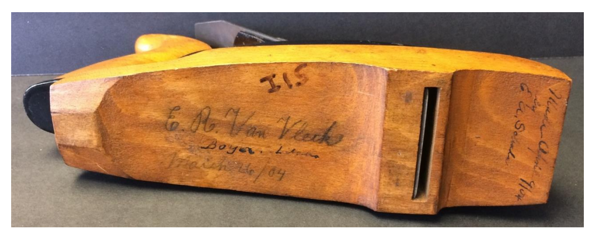
Figure 2 View of sole of prototype plane

Returning to the prototype furring plane, it was made by modifying the sole of a No. 35 plane. As can be seen in Figure 1, Figure 2, and Figure 3 the sole has been by hollowed out ahead of and behind the mouth, leaving small bearing surfaces at the mouth and heel (the purpose of the two small bearing surfaces is to allow the plane to follow the contours of rough sawn lumber when planing the "fur" off rather than to produce the flat surface that typical smooth planes produce). Figure 3 shows that the hollowing out at the toe was not done very carefully; the cut is slanted across the toe of the plane. Figure 3 also clearly shows the markings on the nose of the plane: the Model Shop number 3706 and STANLEY / RULE & LEVEL COMPANY / NO. 35 with the last line being cut in half.