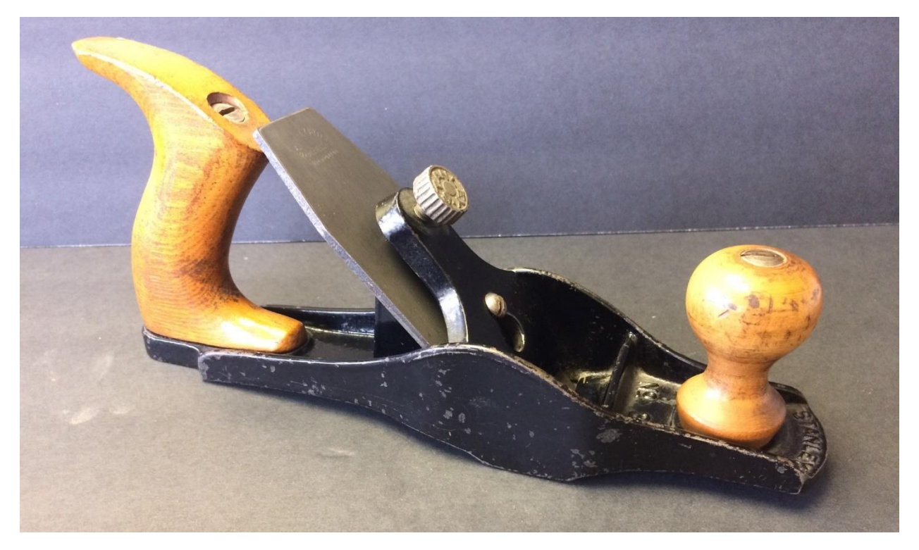
Figure 5 Stanley No 340 furring plane

of the No. 340 or did Stanley consider making a transitional furring plane. If the latter, one suspects that the time of consideration must have been very brief because the wood sole of the plane with its small bearing surfaces near the mouth and heel would have worn away very quickly when used on rough lumber.