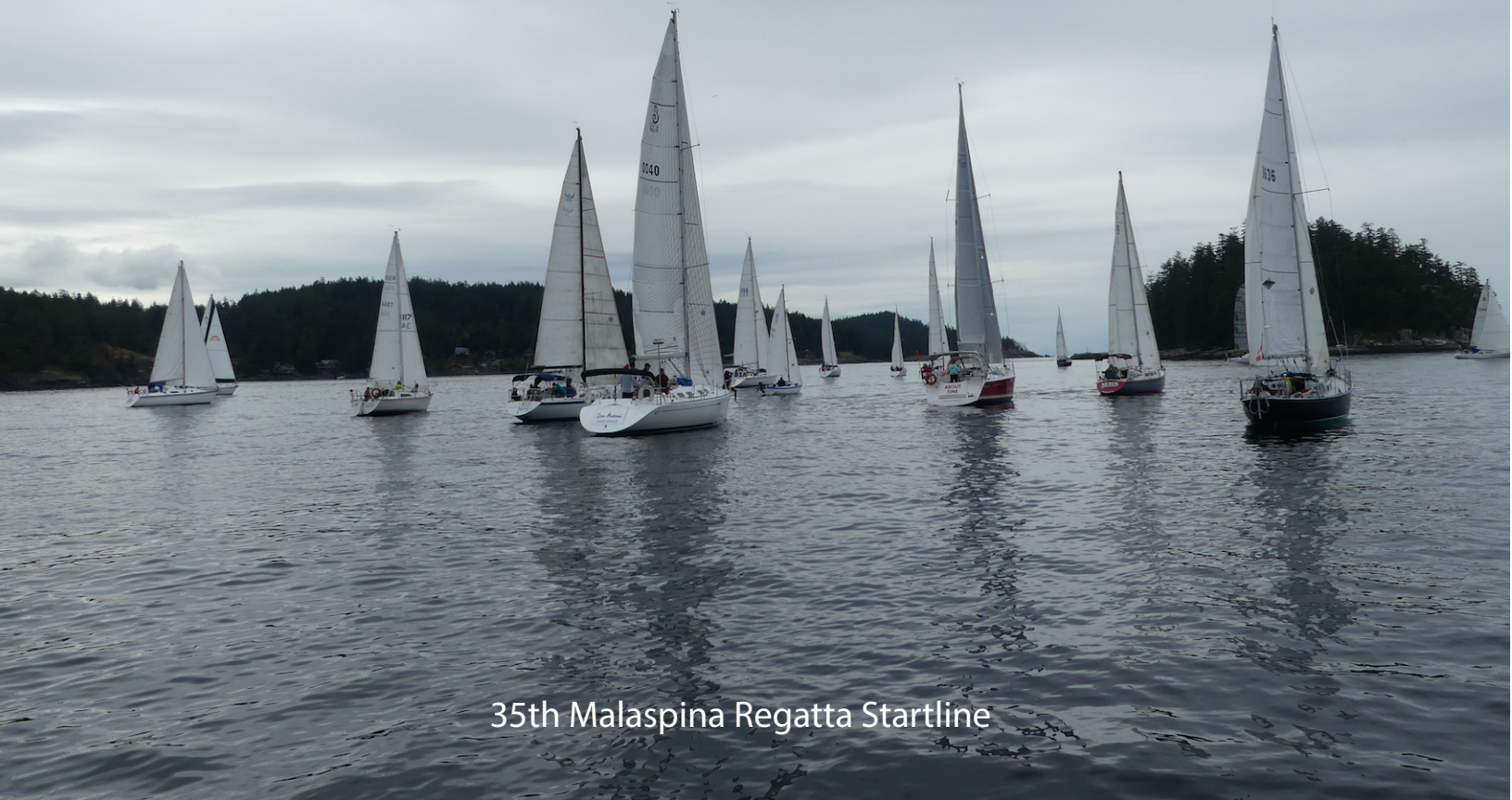
35th Malaspina Regatta Startline