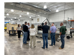
Attendees viewing the new OMAX Waterjet.