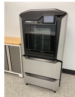
Stratasys F170 FDM 3D Printer Additive Manufacturing Studio

TDI created an Additive Manufacturing Studio that will be home to many 3D printers and a Hexagon Scanning Arm. This arm will help the engineers increase their reverse engineering capabilities and capture complex geometric and surface measurements.