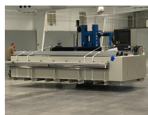
OMAX Waterjet delivery at TDI

In addition, the fabrication shop received upgrades of new paint, flooring, lighting and HVAC. New equipment has started to arrive as well! The newest machine in the facility is the OMAX 60120 Waterjet. This machine is larger than the previous waterjet at TDI and has even more capabilities including cutting angles from 0-60 degrees, automatic taper compensation, and an environmentally "green" operating system.