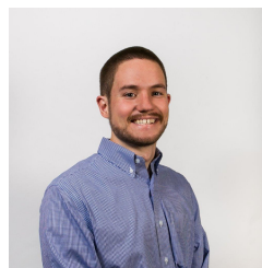
KANSAS STATE UNIVERSITY | Technology Development Institute