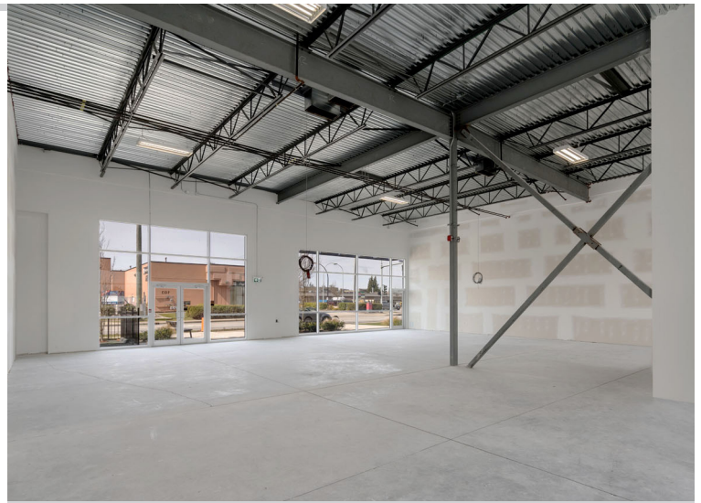
Expansive Windows and 16 Foot Ceilings