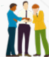
Knowledge exchange + real business opportunities