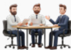
Visibility among key decision-makers