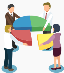
Value Proposition for Participants