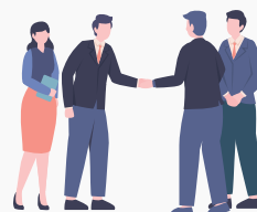
Opportunity to convert discussions into deals