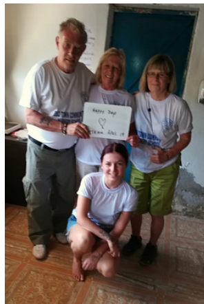
Team April 2019

As we take safeguarding of our children seriously. NO visits are permitted unless prior approval has been authorized