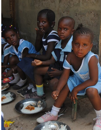
Some children are now having a meal supplied by Lower Basic school for 12p / meal. Some parents can afford some can't. Thank you for supporting the children, and giving them an opportunity of a FREE education.

We trustees have had to take a long hard look at our fees to educate a child in education within our school. Nurserv School education in The Gambia is private sector, and is very expensive, therefore children would only be able to go to a government run school from the age of 7. We can give a free education to all our children. We are having to make adjustments to our fees and are pleased to announce the options available to sponsor a child at our school.