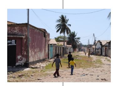
Love never fails 1 Corinthians 13:8

come and visit us and will inform us of how she and her family are doing.