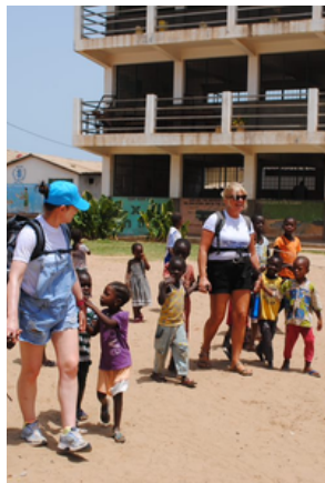
Team April 2019

We welcome anybody to visit our school and meet our wonderful children. If you wish to attend, we ask that you complete a visitor application form, which can be downloaded from our web page, and forwarded to the Trustees for approval 8 weeks prior to your intended visit.