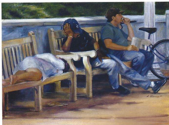
BEACH DWELLERS, ACRYLIC ON CANVAS, 18 X 24"