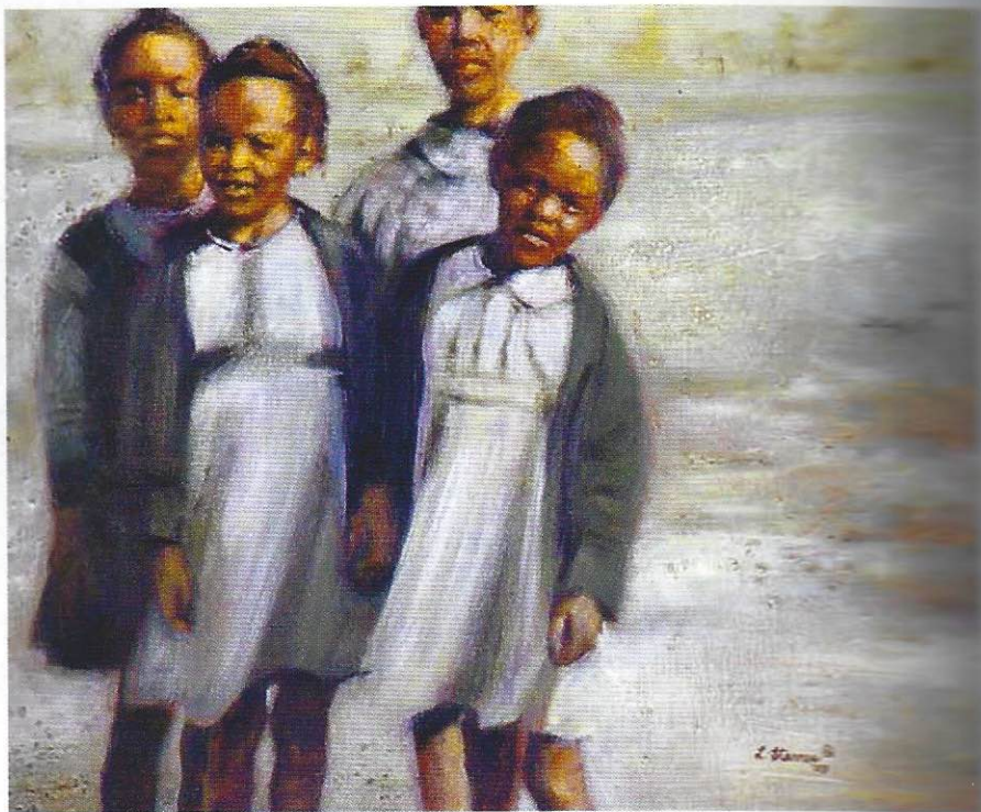
FOUR LITTLE GIRLS, ACRYLIC AND GROUND MEDIUM, 16 X 20"