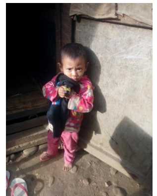
Clothing and hat give away at IDP Camp