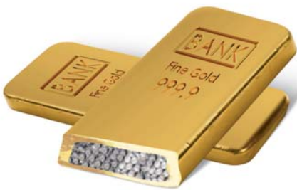
Schematic drawing of counterfeit gold bar with a core of tungsten sticks and gold cover

The SIGMASCOPE GOLD B can determine the electrical conductivity of thicker gold bars up to approx. 1 kg in weight. As measurements are taken from both sides, the bars can be analysed in their full depth so the authenticity of the alloy or fine gold can be verified. Even concealed inclusions of ignoble materials with matching density (e.g. tungsten) can be detected clearly with SIGMASCOPE GOLD – and identified as fraudulent.