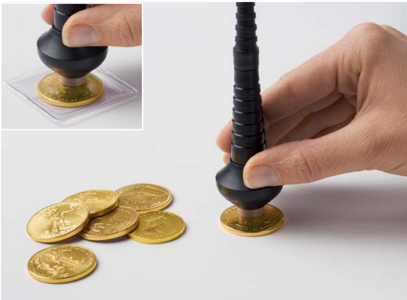
Electrical conductivity measurement on coins – fast and reliable even through plastic covers

The SIGMASCOPE GOLD C offers 4 unique measurement ranges, technically optimised for authenticity testing of a huge variety of different coins up to thin ingots and detects reliably adulterated alloys and forgeries.