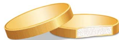
Schematic drawing of counterfeit coins filled with a powdered tungsten alloy and covered with gold

Therefore, it is possible to authenticate these items based on their electrical conductivity.