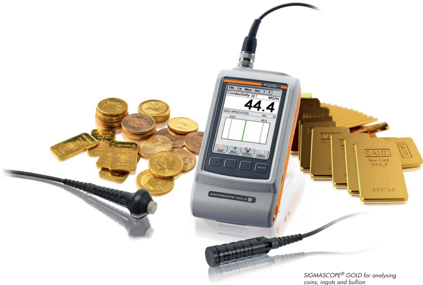
SIGMASCOPE® GOLD for analysing coins, ingots and bullion

In recent years the price of gold and other precious metals has skyrocketed, making the purity of these valuable components the most important attribute of any precious metal product. Adulterated or fraudulent alloys of high-value coins or bullion can lead to considerable monetary losses. The only way to rule out such risks is to test the items using trusted analytical methods.