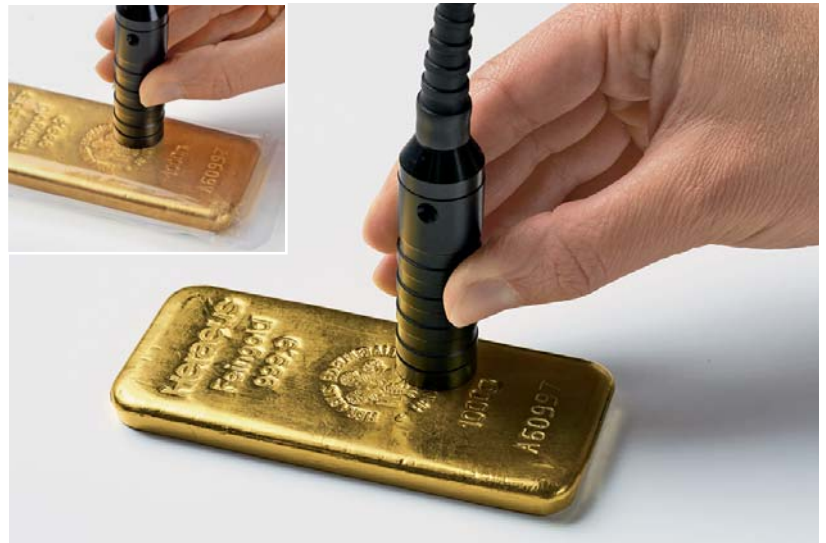
Testing of a fine gold bullion – even under a plastic cover

Before starting a measurement the SIGMASCOPE GOLD B asks for the thickness of the bar to automatically switch to the optimised measurement range with ideal set-up of the instrument. Thus, making handling of the SIGMASCOPE GOLD easy and self-explaining.