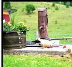
Campbell County Conservation District Farmland Work Group Backroads Farm Tour