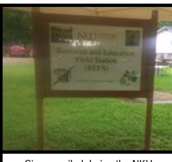
Sign unveiled during the NKU Research and Education Field Station Grand Opening

NKU CER- The Northern Kentucky University's Center for Environmental Restoration has been approved to complete restoration and preservation work in the St. Anne Woods and Wetlands including invasive species removal. They have initiated boundary marking of the south Wetlands 1 and invasive species removal.