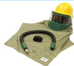
BULLARD 88 HOOD