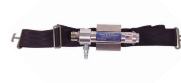
MSA BREATHING AIR LINE