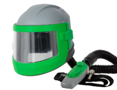
APOLLO 600 HOOD