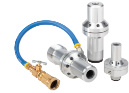
WIN WATER INJECTION NOZZLES