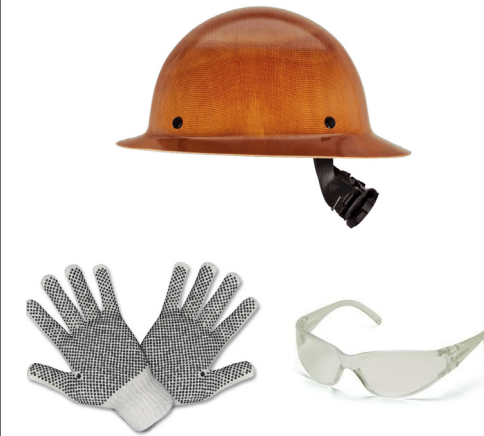
PPE and SAFETY