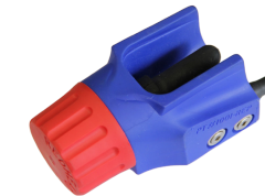
3 WIRE REDHEAD DEADMAN