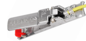
CLEMCO RLX DEADMAN