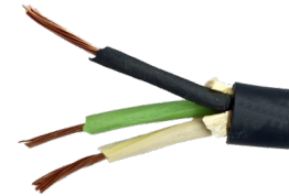
S/O CORD | CONTROL LINE