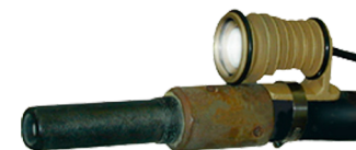
HALOGEN ALUMINUM LIGHT