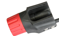
2 WIRE REDHEAD DEADMAN