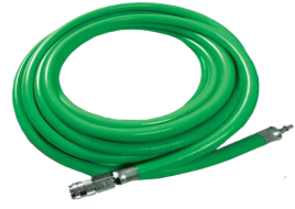
RPB BREATHING AIR LINE