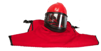
MSA ABRASI-BLAST HOOD