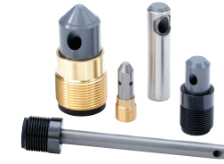
ANGLE BLAST NOZZLES