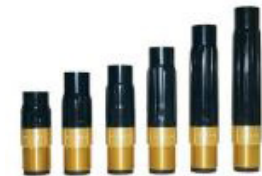
BRASS POLY NOZZLES