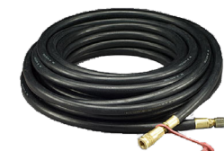
MSA BREATHING AIR LINE