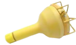
YELLOW WOODHEAD LIGHTS