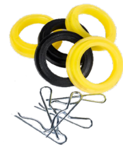
BLAST HOSE REPLACEMENT PARTS