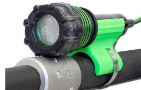
LED BLAST LIGHT