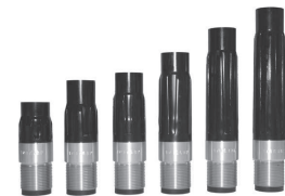
ALLOY POLY NOZZLES