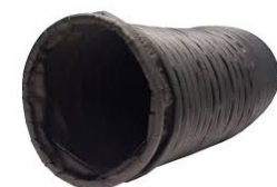
DUST COLLECTION CHUTE