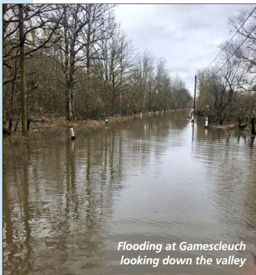
Flooding at Gamescleuch looking down the valley

The effect this may be having on both the frequency of the flooding and on the Atlantic salmon reaching their spawning grounds is still being researched. Site visits have been carried out by experts from Tweed Foundation in relation to the salmon, NatureScot interested in whether the gravel is coming from clear fell in upstream forestry, SBC Flood engineers and one of the top SEPA hydrologists – no consensus reached on what to do as yet. Any solution will no doubt be expensive but the current situation is dangerous and a resolution to the flooding must be found sooner rather than later.