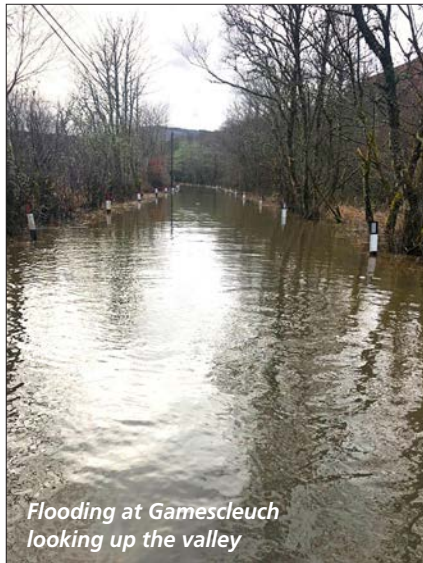
Flooding at Gamescleuch looking up the valley

Flood signs are erected at both ends by local volunteers as part of the community resilience plan but the flood water rises very quickly and continues to catch people out. The road flooding is now a standing item on the community council agenda and the SBC Flood Team are well aware of the issue. Work has