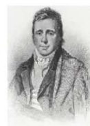
The Ettrick Shepherd