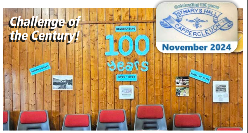
As our 100th anniversary is in November, we would love it if you could add photos, memories etc to our wall. Please feel free the next time you are in St Mary's Hall to add a photo or just have a wee look!