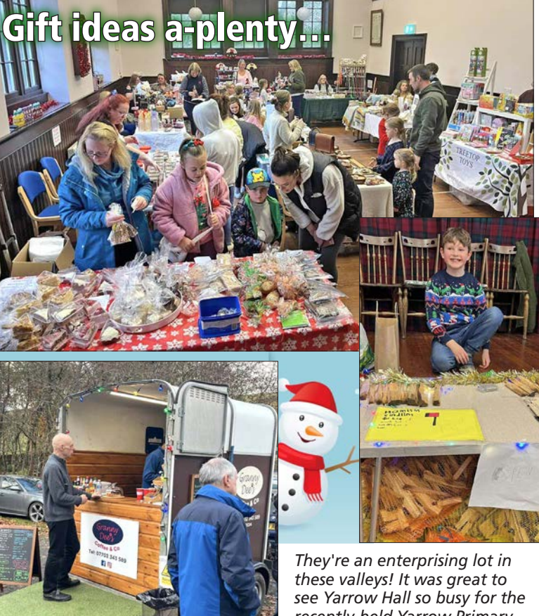
They're an enterprising lot in these valleys! It was great to see Yarrow Hall so busy for the recently-held Yarrow Primary School Christmas Fayre. Over £600 was raised for the school! Thanks go out to all who supported the event.