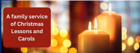
A family service of Christmas Lessons and Carols

A Family Service of Christmas Lessons, Carols, the Christmas story, colourful lighting, candles and mulled wine.