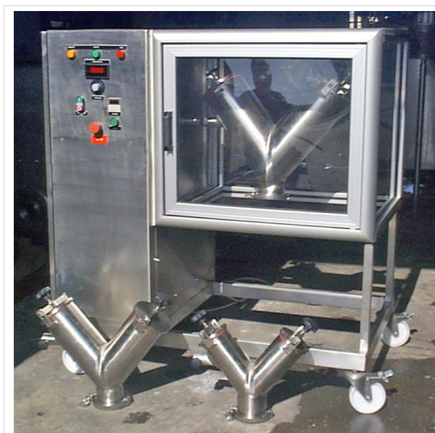
Special Design with Interchangeable Vessels