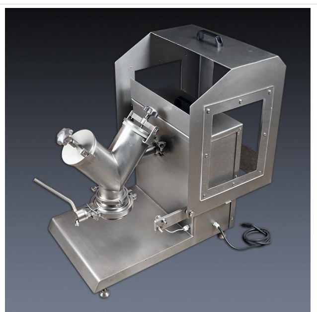
Lab-size PVM-5 Mixer