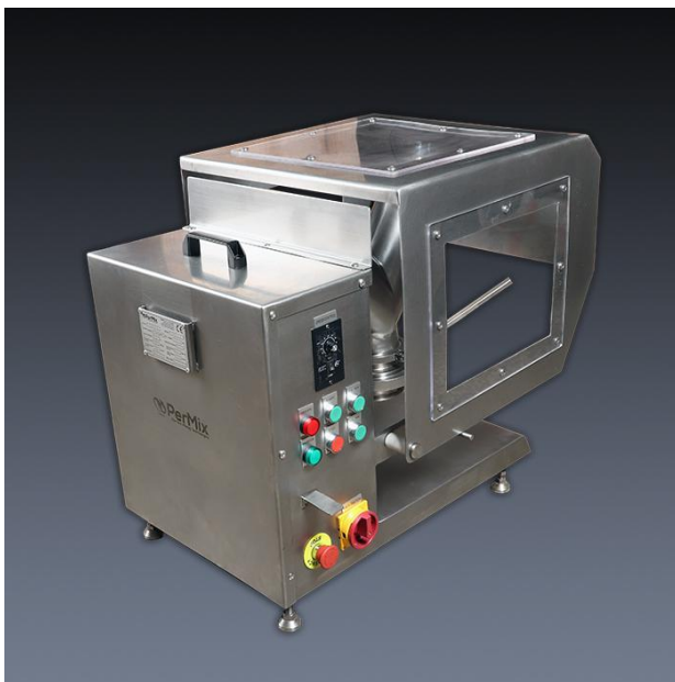
PVM-5 Mixer with Electric Control Panel