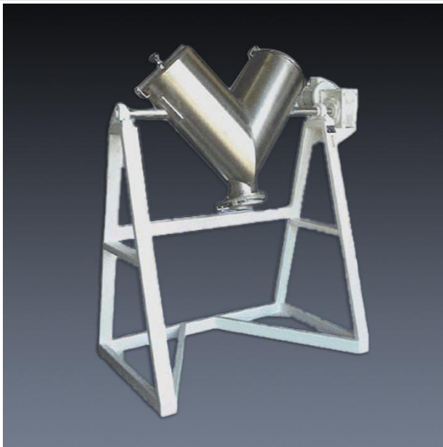
Standard PVM V-shaped Mixer