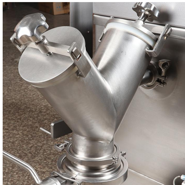
Vessel of PVM Mixer