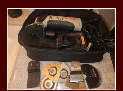
Craftsman 12-Volt Cordless Multi-Tool, Bag, Charger, & Extra Attachments. $40