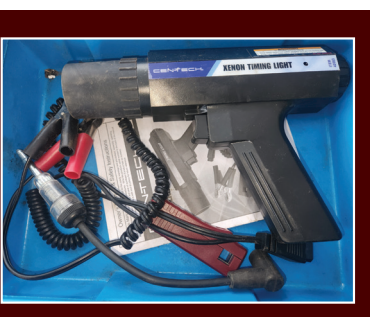
Cen-Tech Xenon Timing Light & Spark Plug Tester