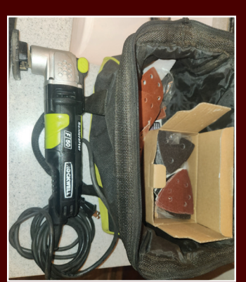
Rockwell F50 Sander, Bag, & Sanding Pad Lot. $40

outside. They're also warmed entirely by body heat. Since fresh, compacted snow is approximately 90 to 95 percent trapped air (meaning it can't move and transfer heat) it's a great insulator. Many animals, such as bears, dig deep holes in the snow to hibernate through the winter.