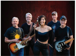
Mad City Radiators Playing 11-3