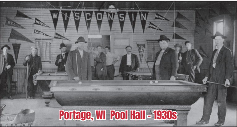
Portage, WI Pool Hall - 1930s

Call 920-992-3137 for an application, submit resume to carrie.butler@gasketsinc.com, or fax to 920-992-3134.