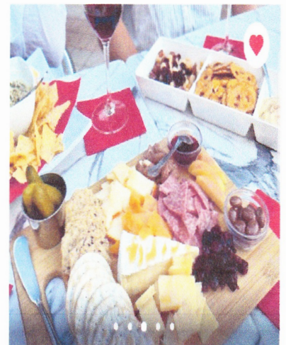
Wine Tasting Experience in Historic Ybor

Expand your palate and meet fellow wine enthusiasts in this engaging wine tasting experience. Sample five distinct wines, each carefully selected to enhance your appreciation of different varietals, while indulging in complimentary small bites. Led by certified hosts, the session offers valuable insights into wine production and tasting techniques, making it perfect for both novices and connoisseurs alike. Connect with others who share your passion for wine in a relaxed and friendly environment.