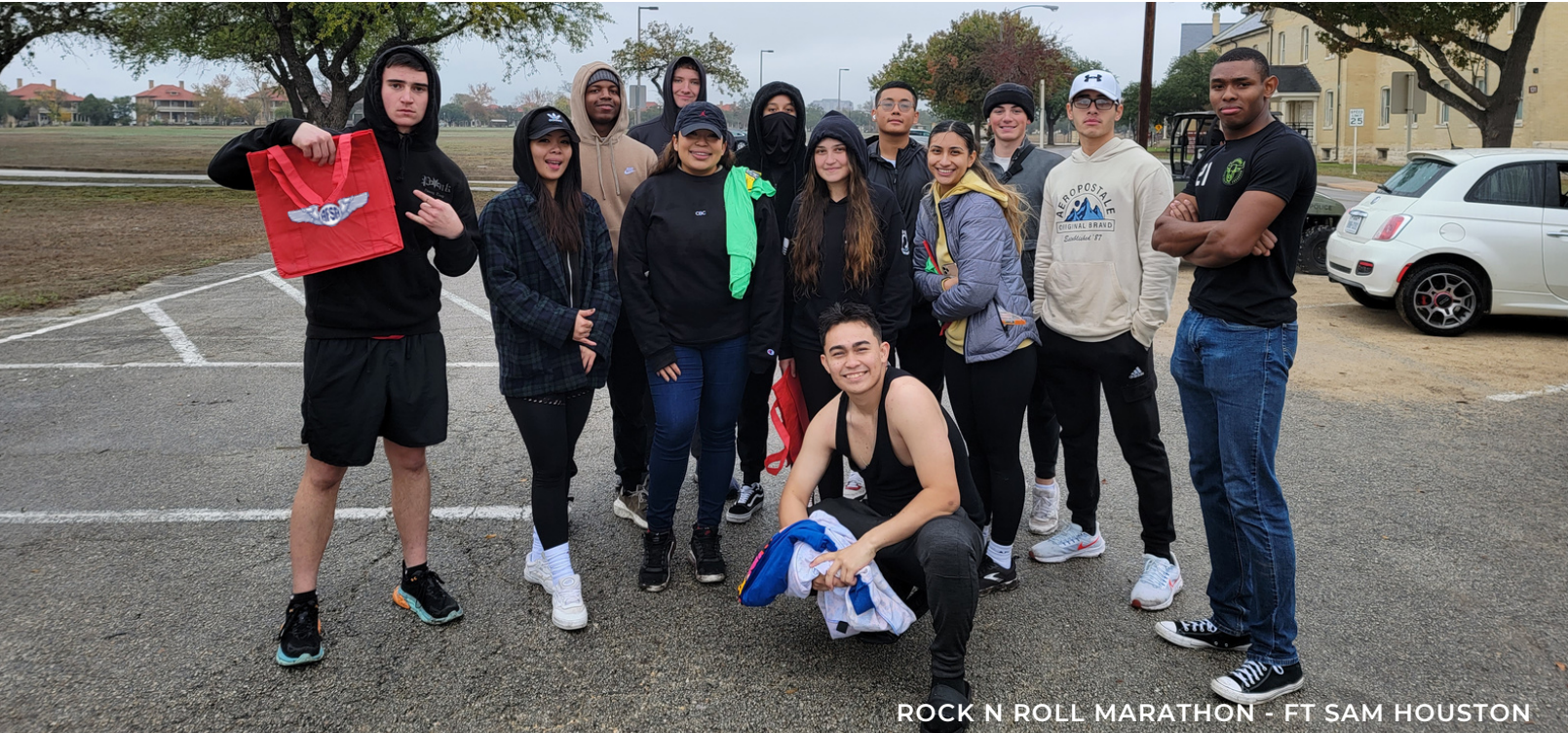
ROCK N ROLL MARATHON - FT SAM HOUSTON