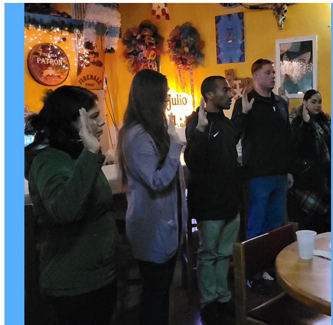
2023 Executive Council

The 2023 Elections wrapped up the year and we are excited for the future of this Chapter. If you are looking for leadership or volunteer opportunities please reach out and get connected. We are making an impact on base and the local area and we need your help.