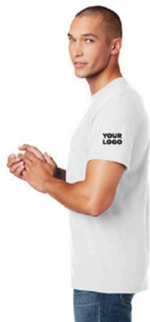
Left/Right Sleeve Bicep