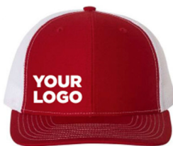
Hat Right Front