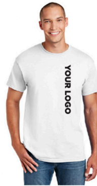
Left Vertical Chest