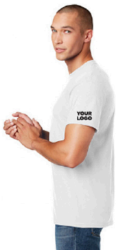
Left/Right Sleeve Above Cuff