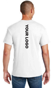
Back Vertical Center