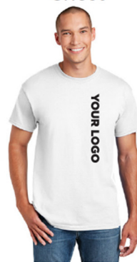
Left Vertical Chest