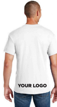
Lower Back Center