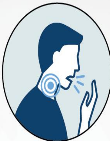
COUGH OR SORE THROAT