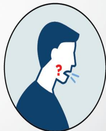
NEW LOSS OF TASTE OR SMELL