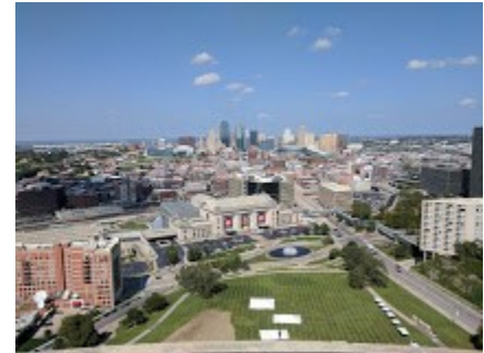
National WWII Museum