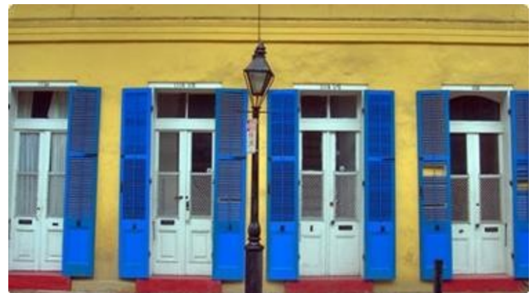
2 Hour City Tour including the Garden District