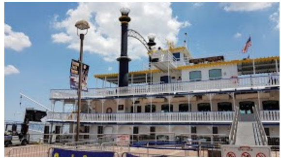
Creole Queen Historic Day Cruise

THURSDAY May 14 - - Visit during breakfast & depart