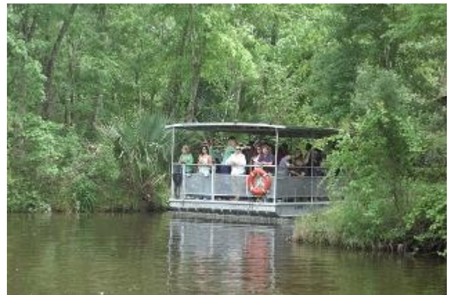
Jean Lafitte Swamp Tour