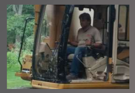
Sewer lines, Water lines, Emergency excavation, Hydro Excavation and more.