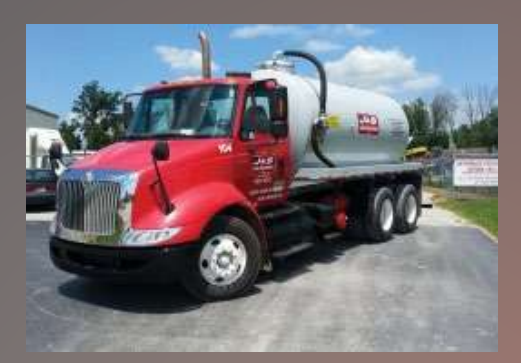
Jetting Service, Sludge Removal, Spill Clean-Up & Much More