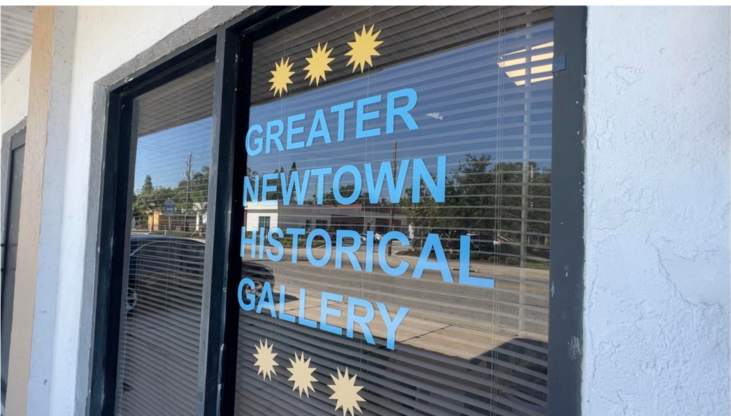
Newtown Gallery sign: Outside of Greater Newtown Historical Gallery

For more information on the Greater Newtown Historical Gallery visit: newtownhistoricalgallery.org . You can stop by the gallery next to Jetson's Salon at 2741 N. Osprey in Newtown, Sarasota.