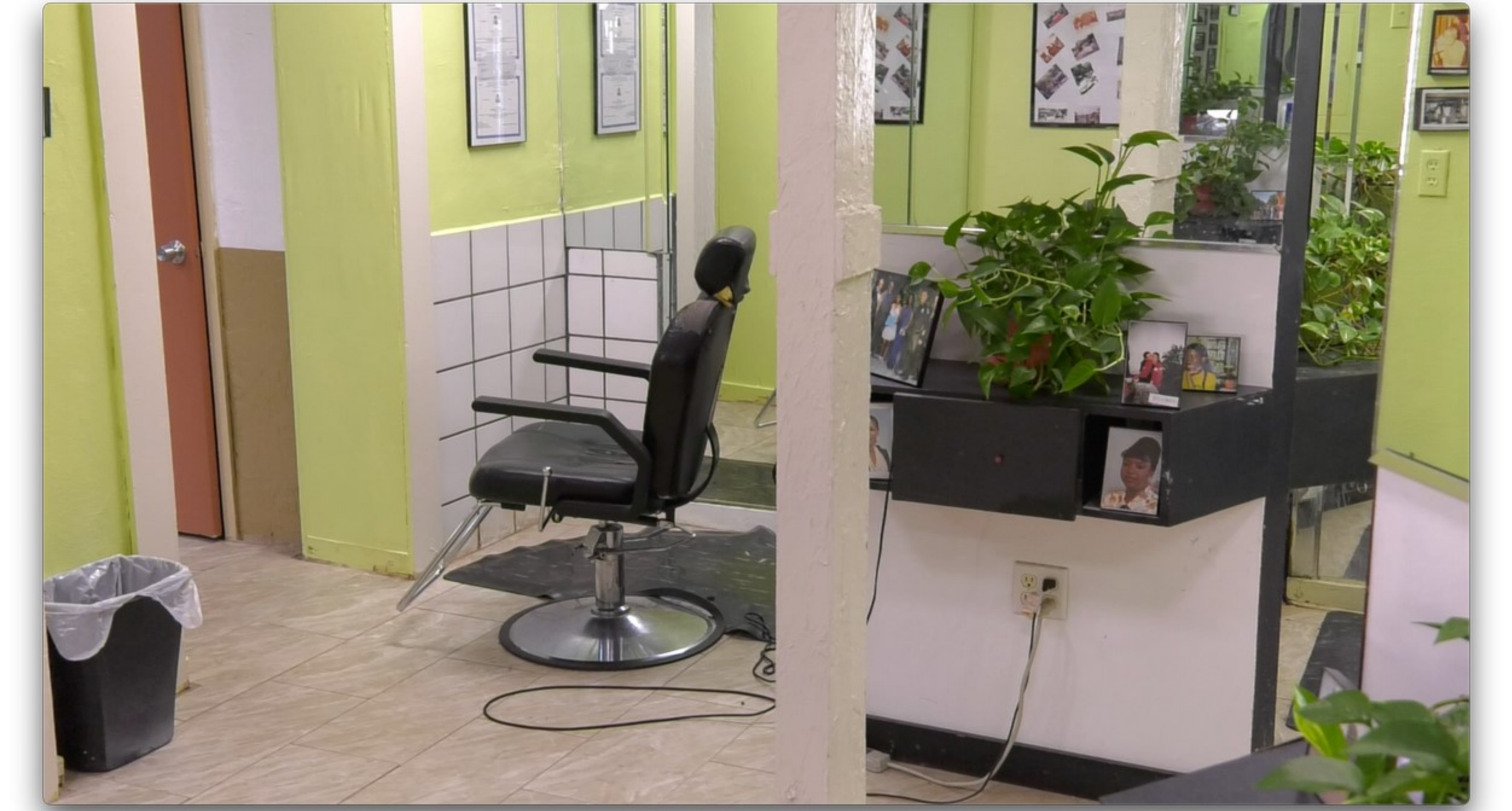
Salon: Jetson's Creative Trends in Newtown, owned by Jetson Grimes.