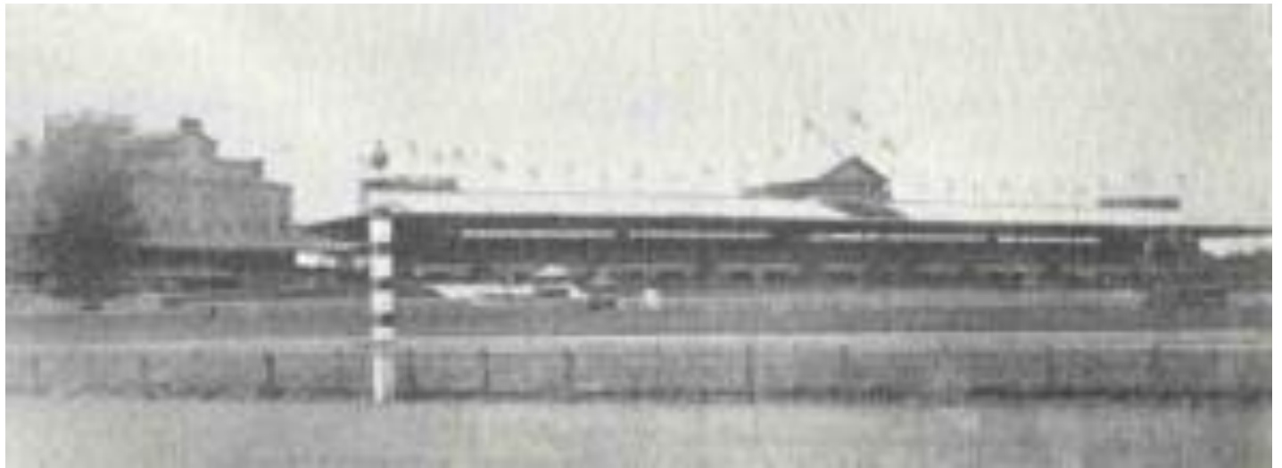
Morris Park Steeplechase Course, Bronx, NY