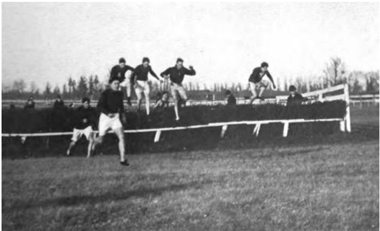
Well Bunched at the First Mile