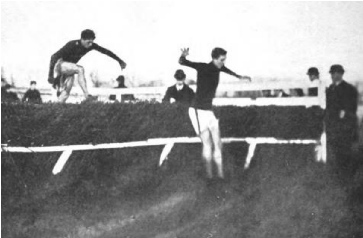
Closely Pressed for the Lead