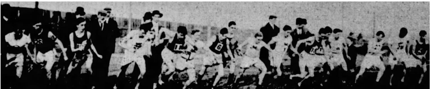
At the Start