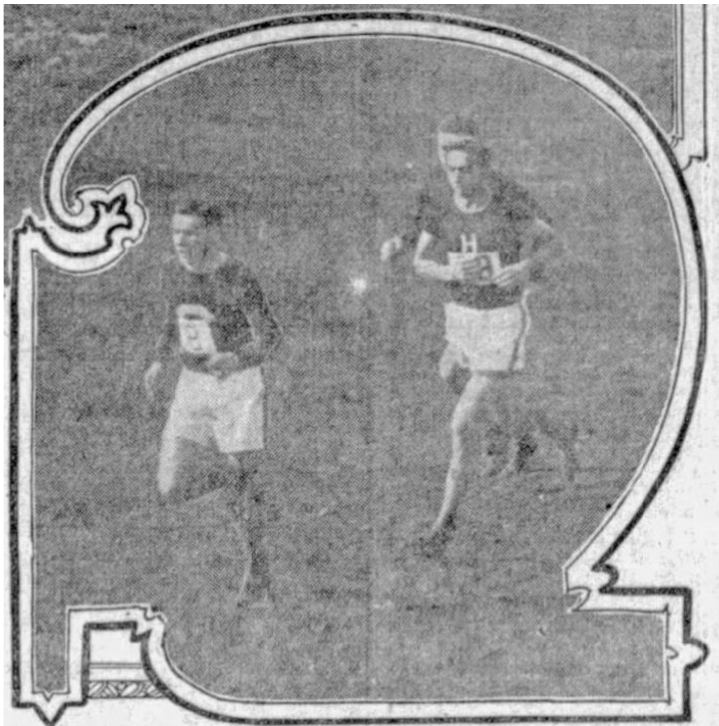
WHEN JONES PASSED WITHINGTON IN THE LAST MILE.