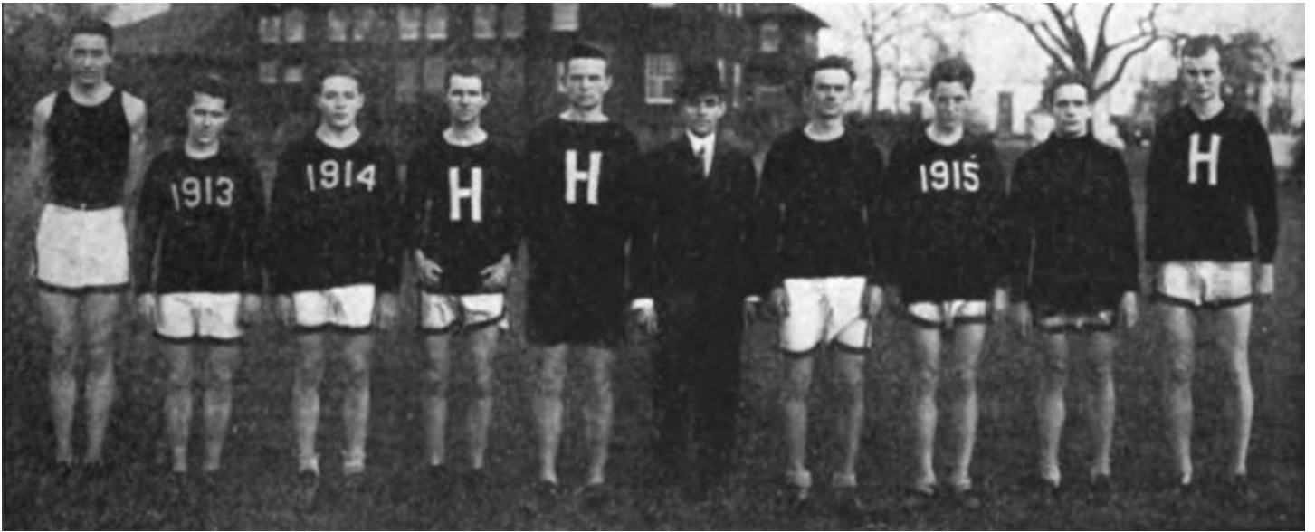
1912 I.C.A.A.A. Team Champions - Harvard University