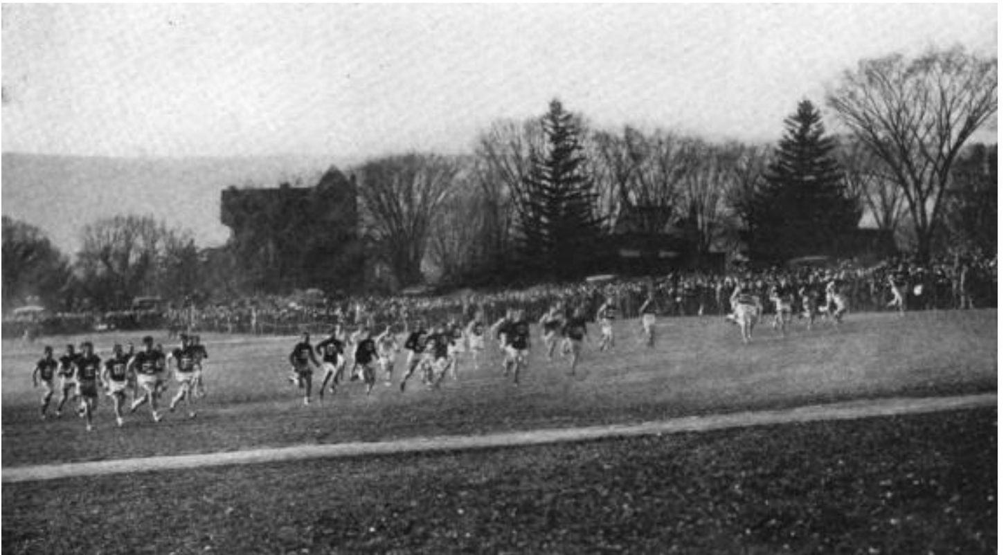
First \frac{1}{4} Mile