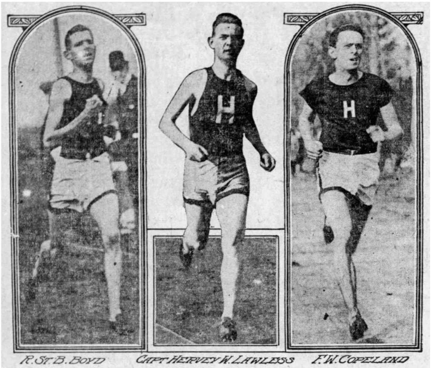
Harvard's top 3 Men