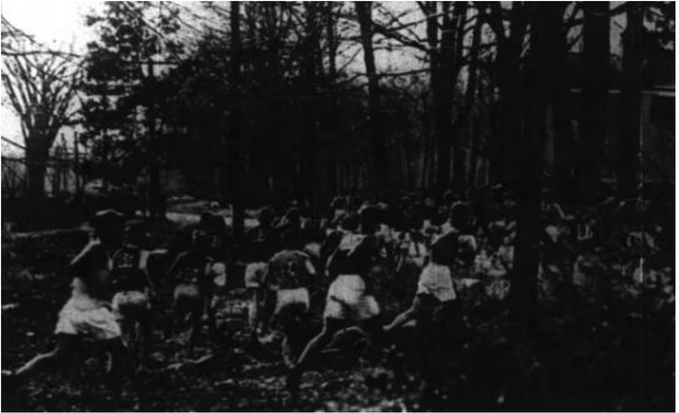
Running through the woods near New Haven