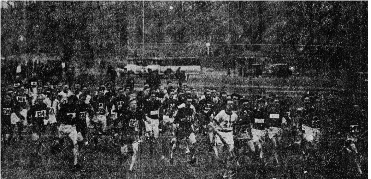
At the start of the 1922 varsity race